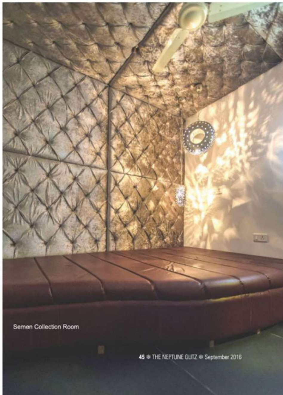
Semen Collection Room