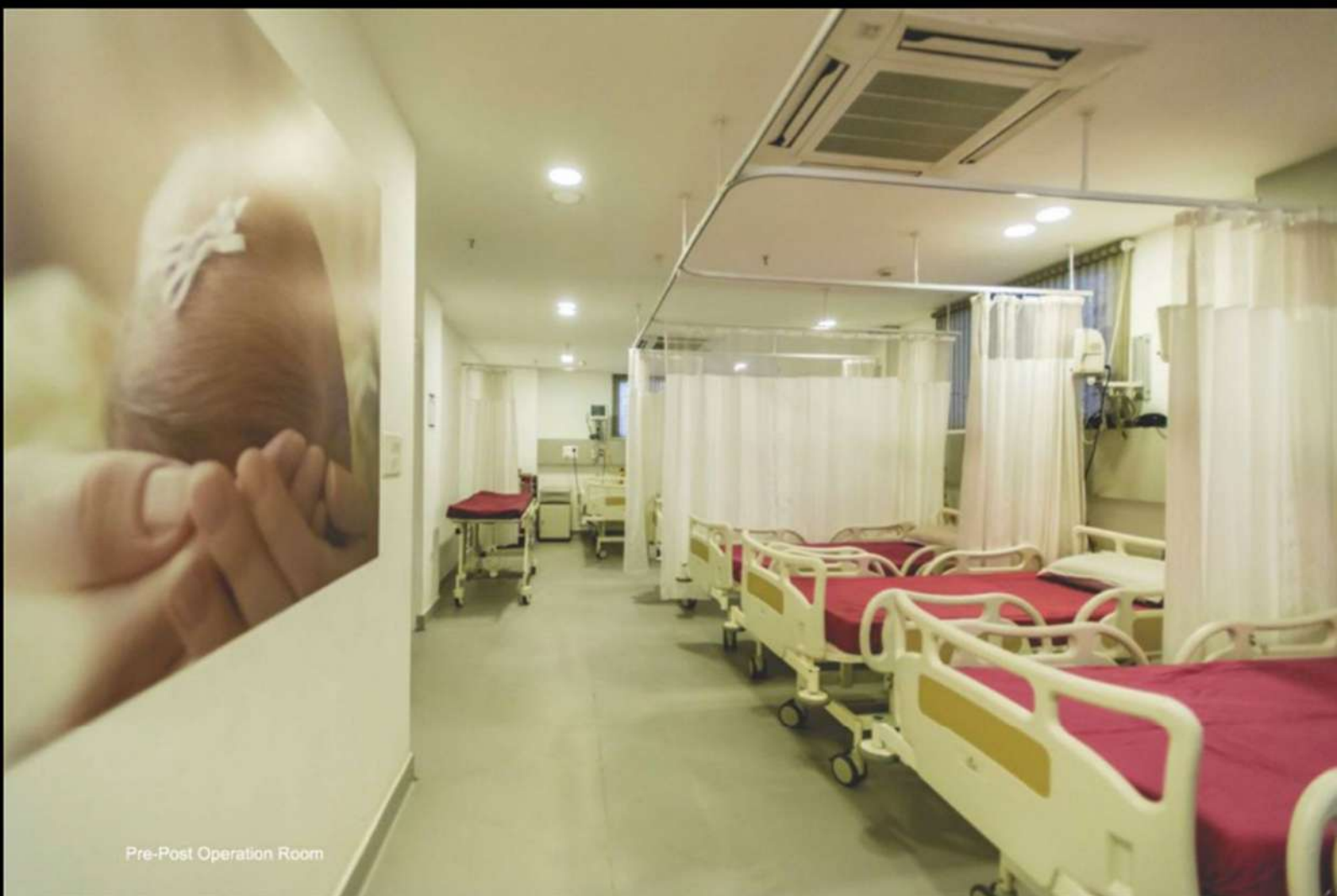
Pre-Post Operation Room

The patient's room has been developed keeping the bright color only on fabrics and neutral shades on fixed panels & fixtures so that one does not get bored of the whole setup. The grooves have been made on the back wall which turns on to the ceiling to give an effect of a larger space than actual. The attendant's couch is also been changed from a typical convertible bed to a fixed low height running seating along the window wall. The corridor accessing the rooms has checkered pattern on all 3 sides & a horizontal stripe of Marsala all along.