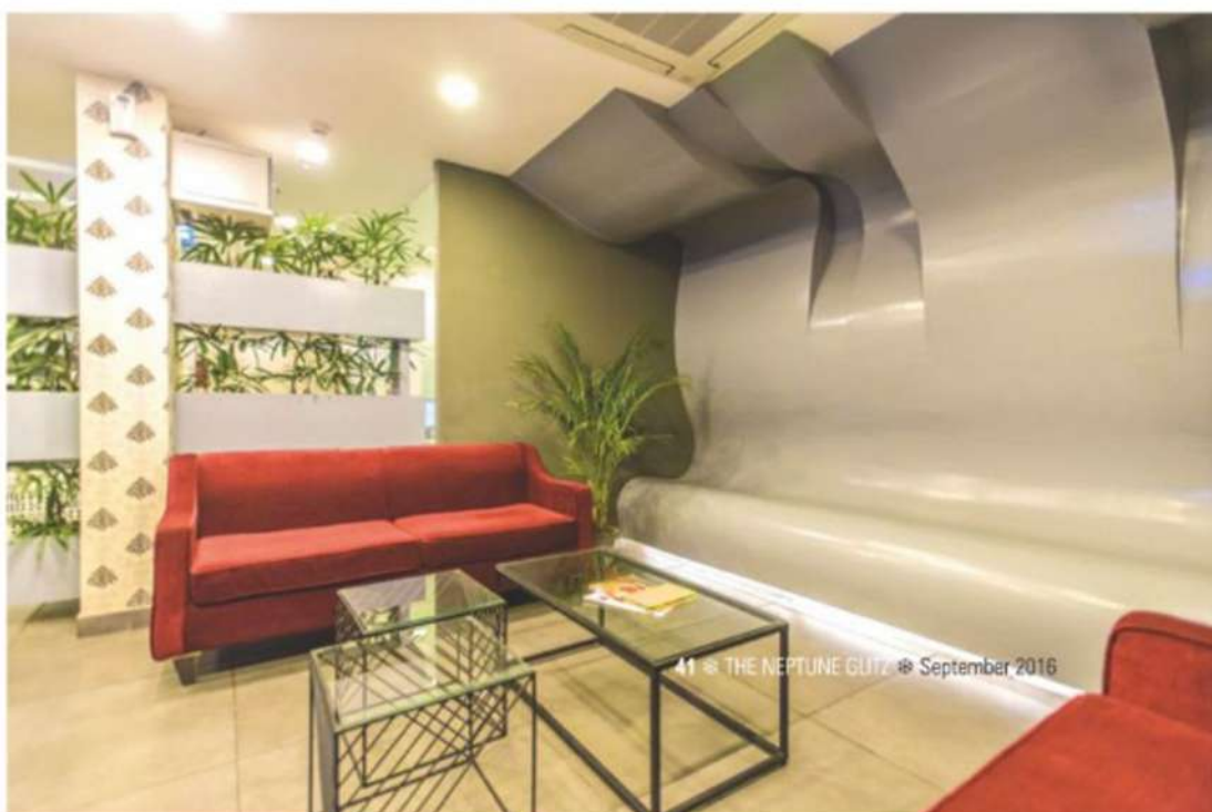
Organic curvilinear ceiling dropping as seat: waiting area

Standing on one of the prime location of South Delhi, the building has been designed with the intention of leaving an impact on everybody's mind who-so-ever crosses the road. The upper floors have stark Marsala colored lacquered panels with the reflection of moving sky all day long which creates a magnificent playfulness along with the backlit perforated box in the center clad with ACP sheet making the structure dynamic in appearance. The perforated ACP sheets have been used to create an enclosure around the lacquered box to demarcate & define the critical zones with the other areas. The Mezzanine floor has a complete glazing which divides the building into two, separating the upper floors from the Ground floor.