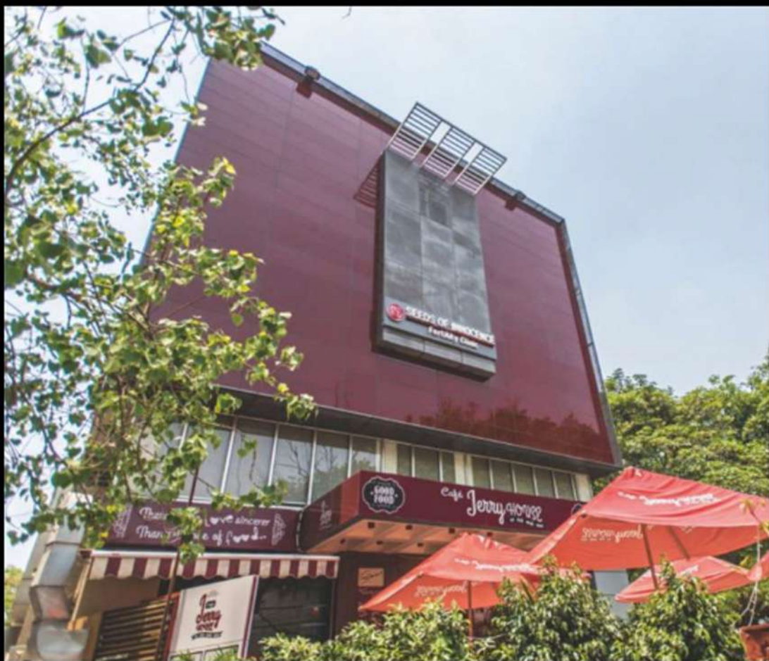
Glance at the facade amongst green