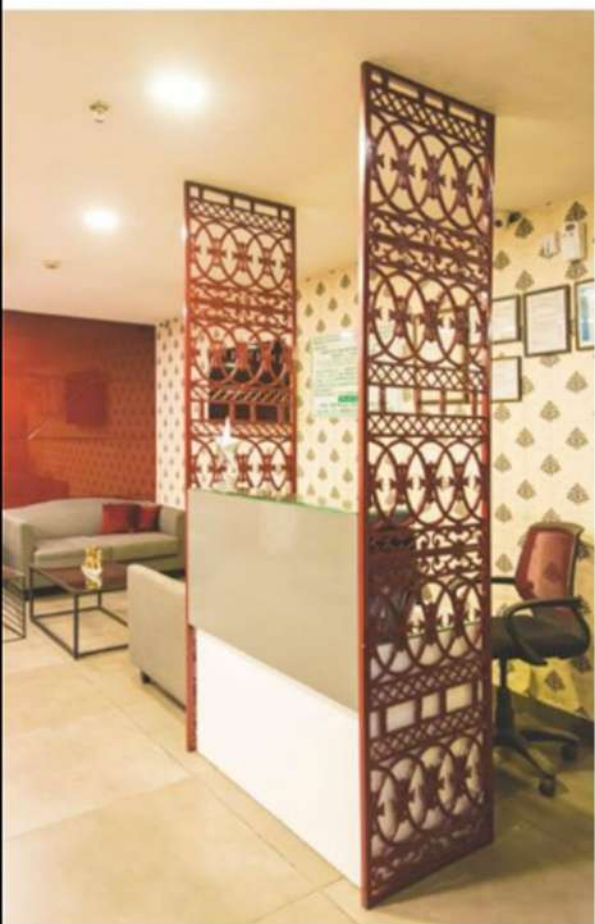
View of reception desk, with MS jaali defined organic pattern

The Fertility Clinic houses 5 OPD chambers, an ultrasound room, injection room, a counselling area, sample collection room, lavatories, billing section, reception & waiting on the Basement Floor. On the Ground we have 50% of the carpet area with us utilized by the pharmacy & a cafe, remaining half of the portion has been sublet to a spa-salon. With 50% of floor space with us on the Mezzanine the NICU & labor room has been planned on it. The patient rooms are on the First Floor along with the Changing Rooms, Scrub, OT & a Pre-Post Operation Room for 2 beds. The IVF Floor which is the Second Floor has Changing Rooms, Scrub, an IVF OT adjoining the IVF Lab, Andrology Lab, Technician's Lounge, Cylinder Store, the sensuous Semen Collection Room, a doctor's room, Waiting area & the Pre-Post Operation Room for 6 beds. The top most floor has open terrace on the rear end of the