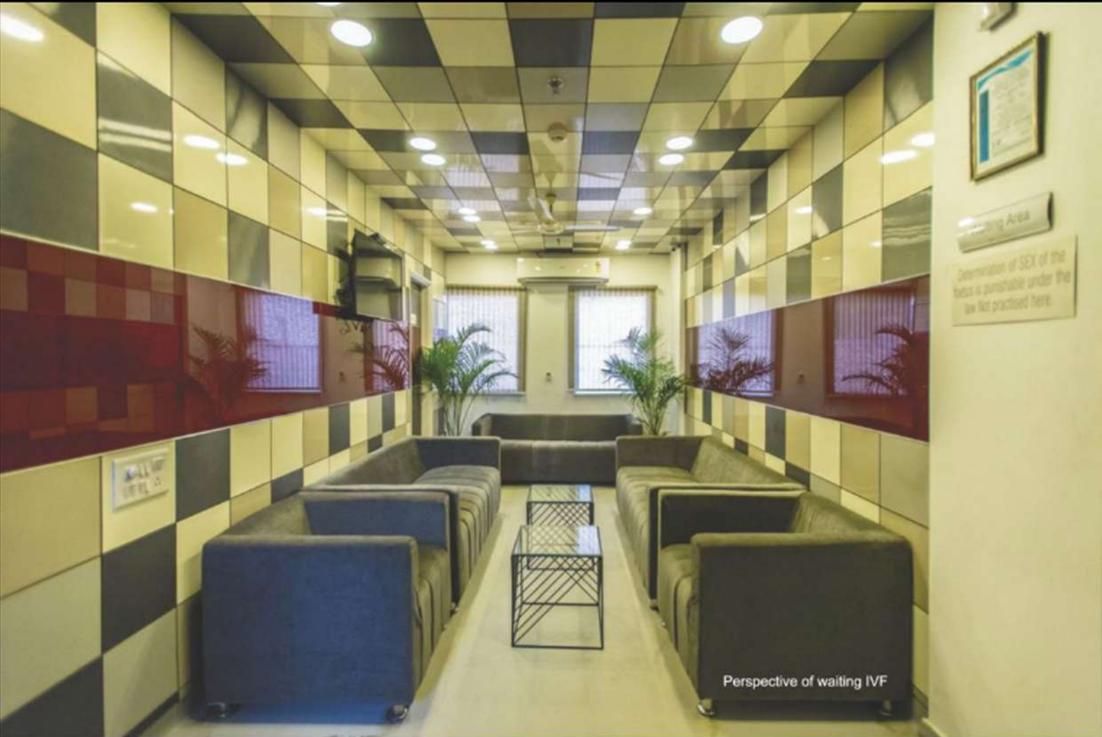
Perspective of waiting IVF