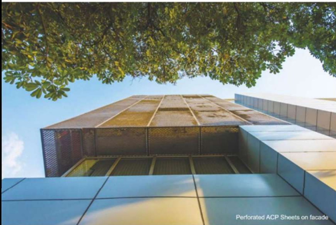
Perforated ACP Sheets on facade