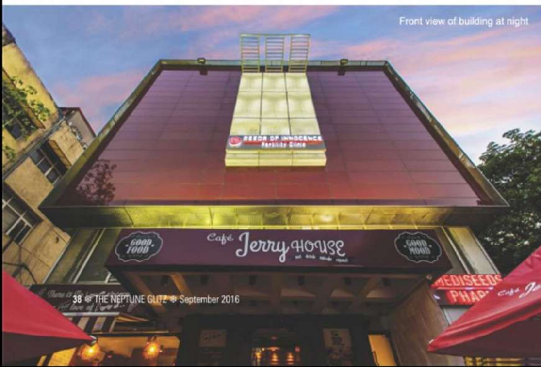
Front view of building at night